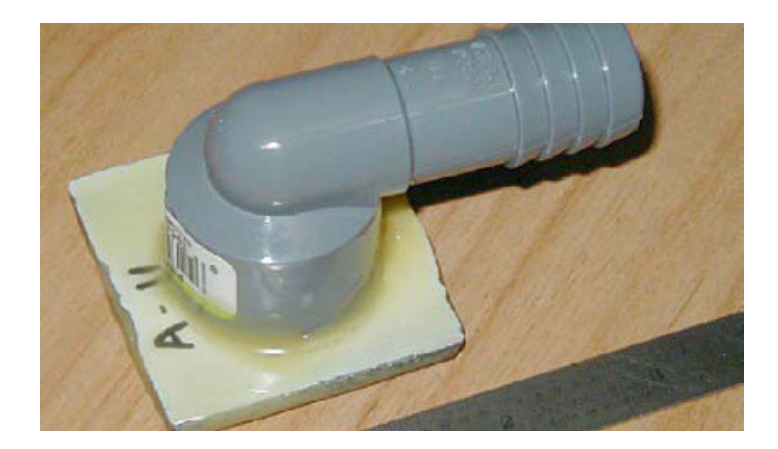
Figure 3. Plastic fitting sealed onto face of shell sample.

Figure 2. Shell dipped on wax and edges ground for