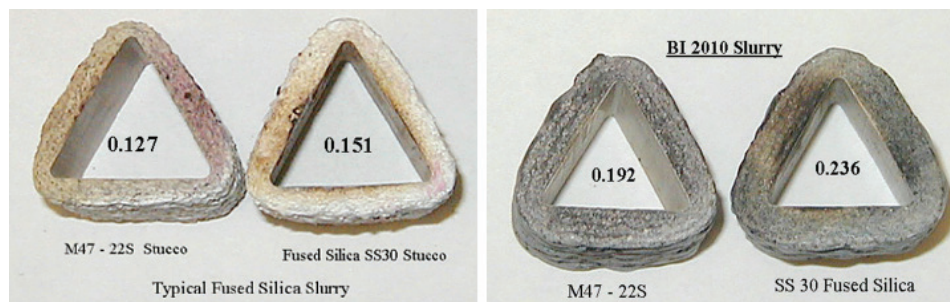
Figure 2: Shell thickness and uniformity Improvement using Organic Fiber enhanced slurries. Equal number of dips on all samples.

Transition Dips: Their function is to gradually fill the detail of the wax pattern after first dip and before the backup